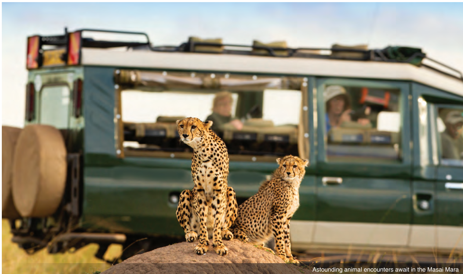
Astounding animal encounters await in the Masai Mara