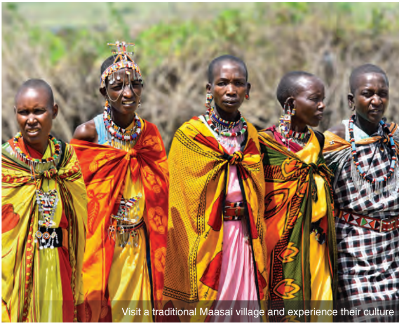
Visit a traditional Maasai village and experience their culture

Rift Valley. Relish in the surrounding sights and sounds of the native wildlife. Beautiful birds along the banks, in the trees, and soaring above; lazy hippos yawning as they emerge from the water; African Fish Eagles swoop down to snatch a fish from the lake for dinner...it all awaits! Check in to the lodge and enjoy a relaxing evening. Meals: B, L, D