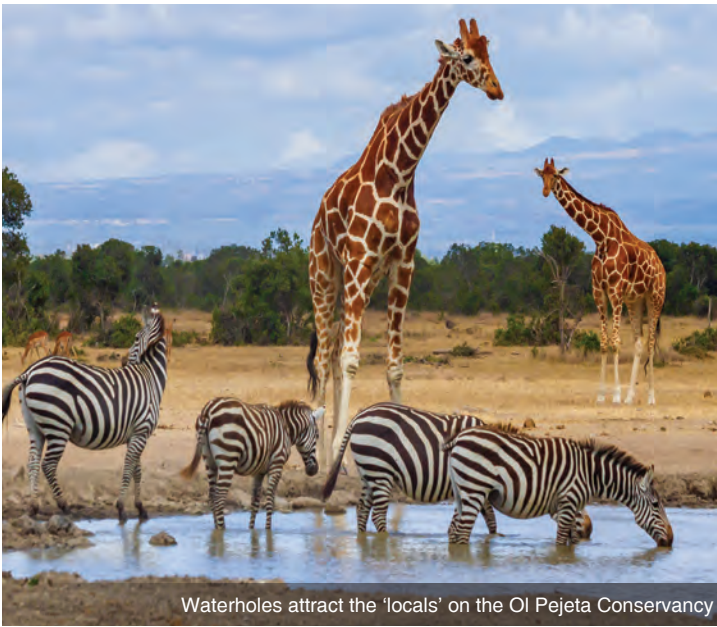
Waterholes attract the 'locals' on the OI Pejeta Conservancy