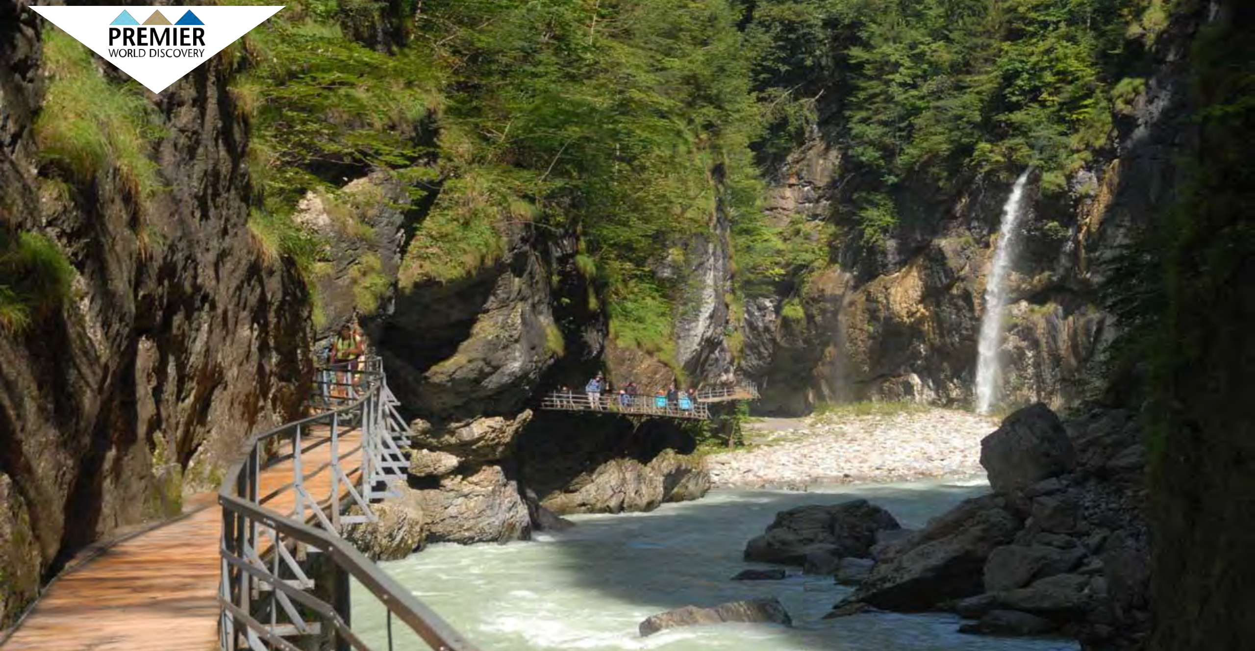
Day 7: Aare River Gorge