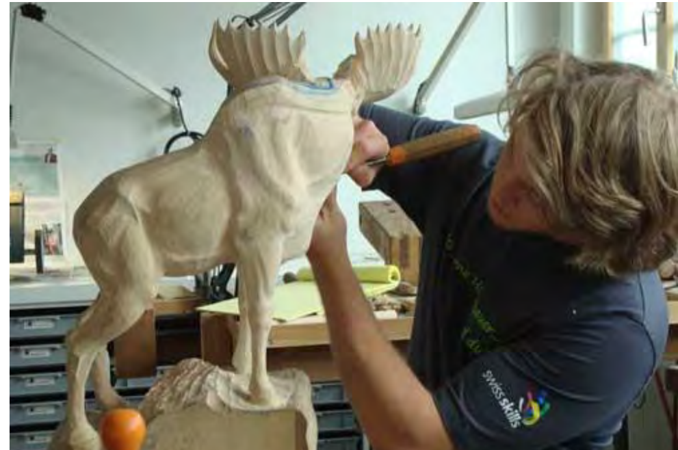
Day 8: Brienz – Wood Carving Shop