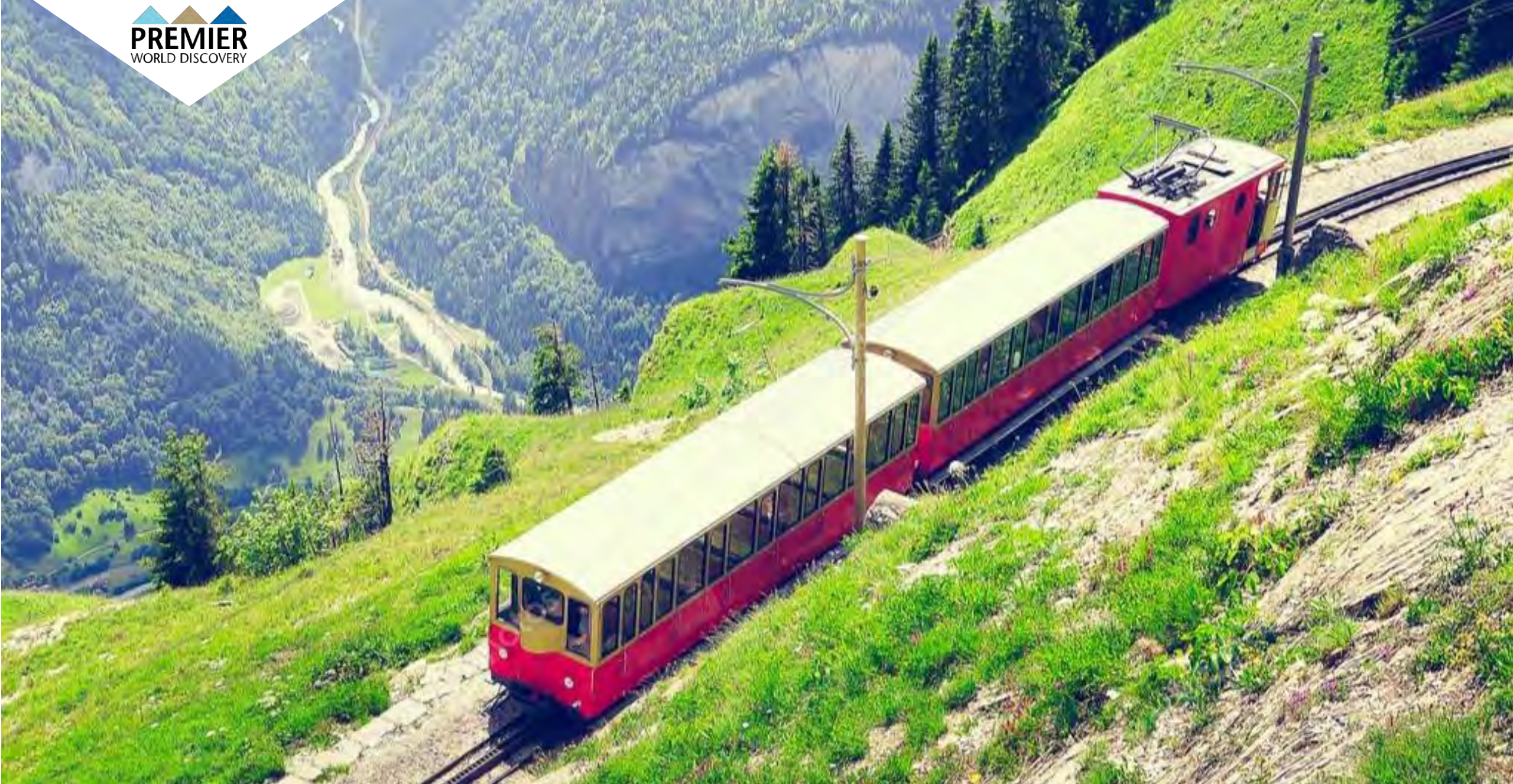
Day 5: Wilderswil - Vintage Cog Railway up to Schynige Platte