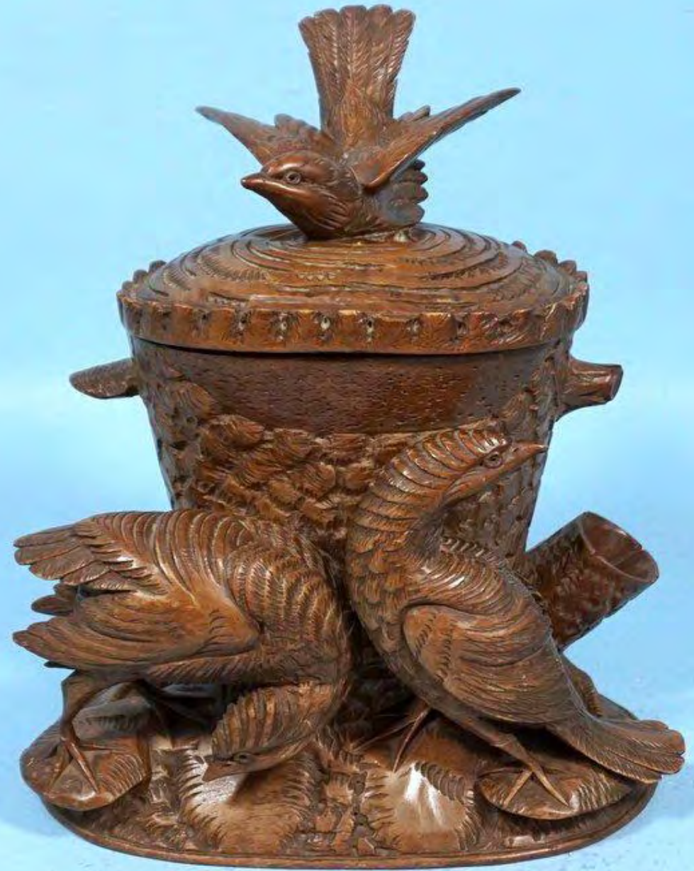
Day 8: Brienz – Wood Carving Shop