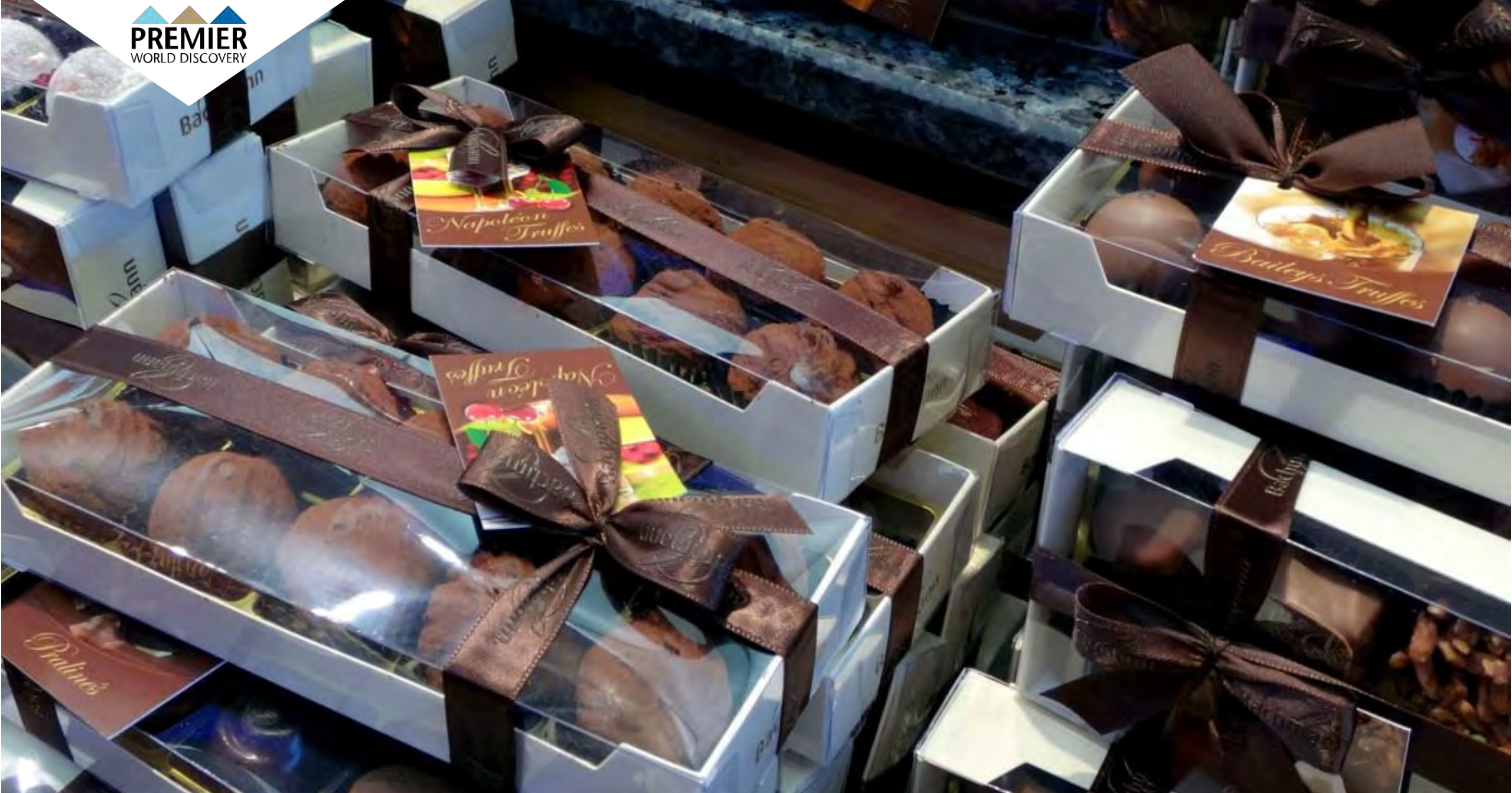
Day 8: Lucerne – Chocolates