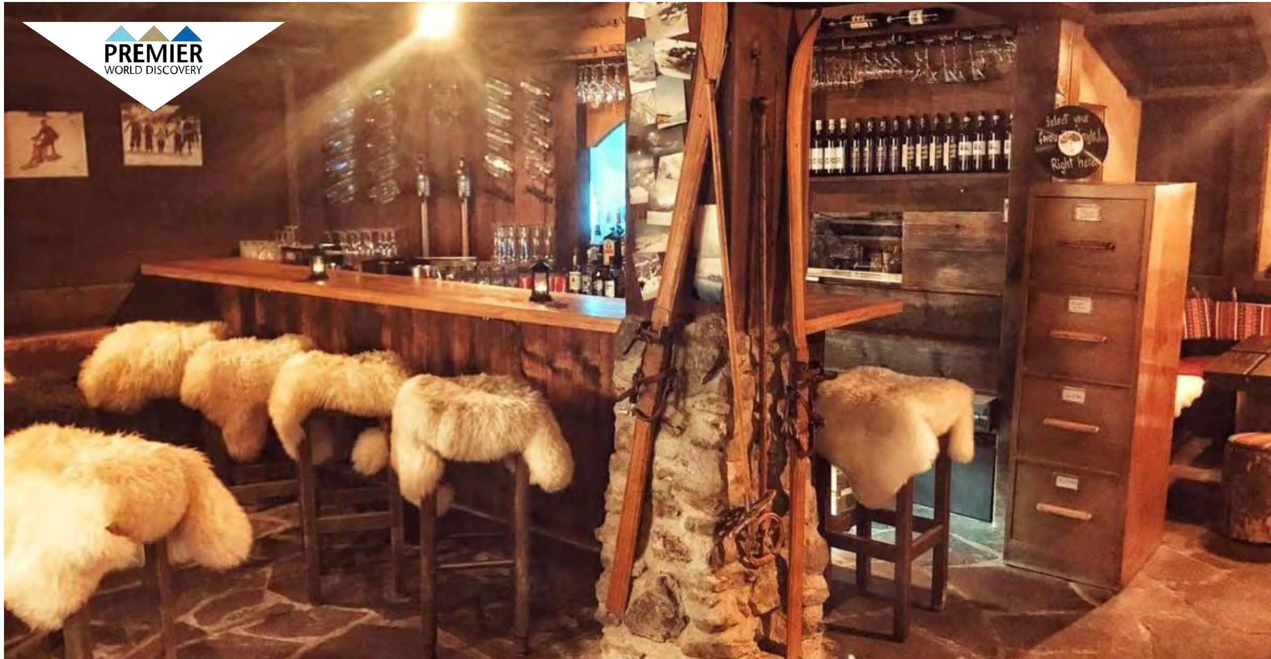
Accommodations – Silberhorn Hotel, Wengen– 6 Nights