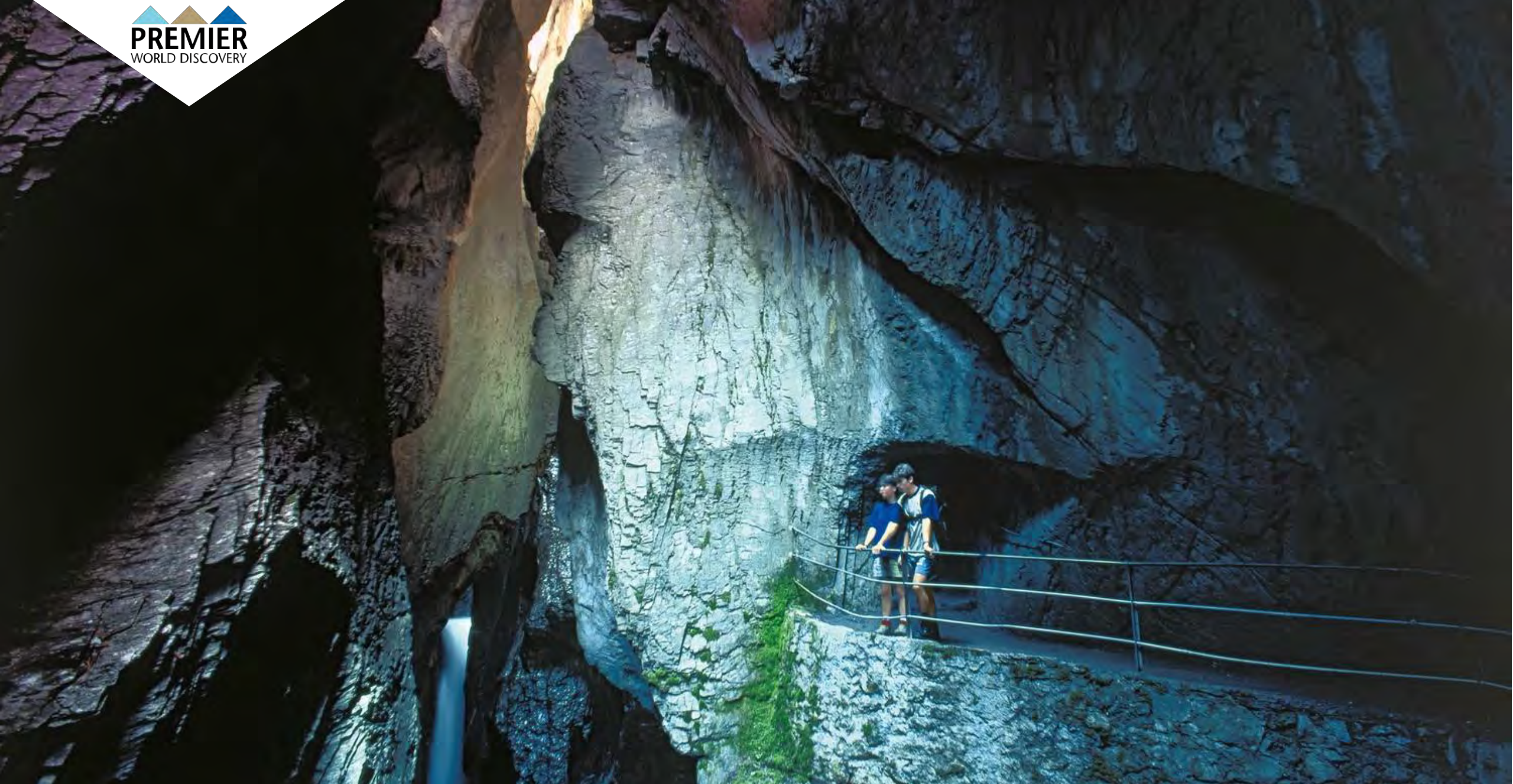
Day 7: Rosenlauri Glacier Gorge