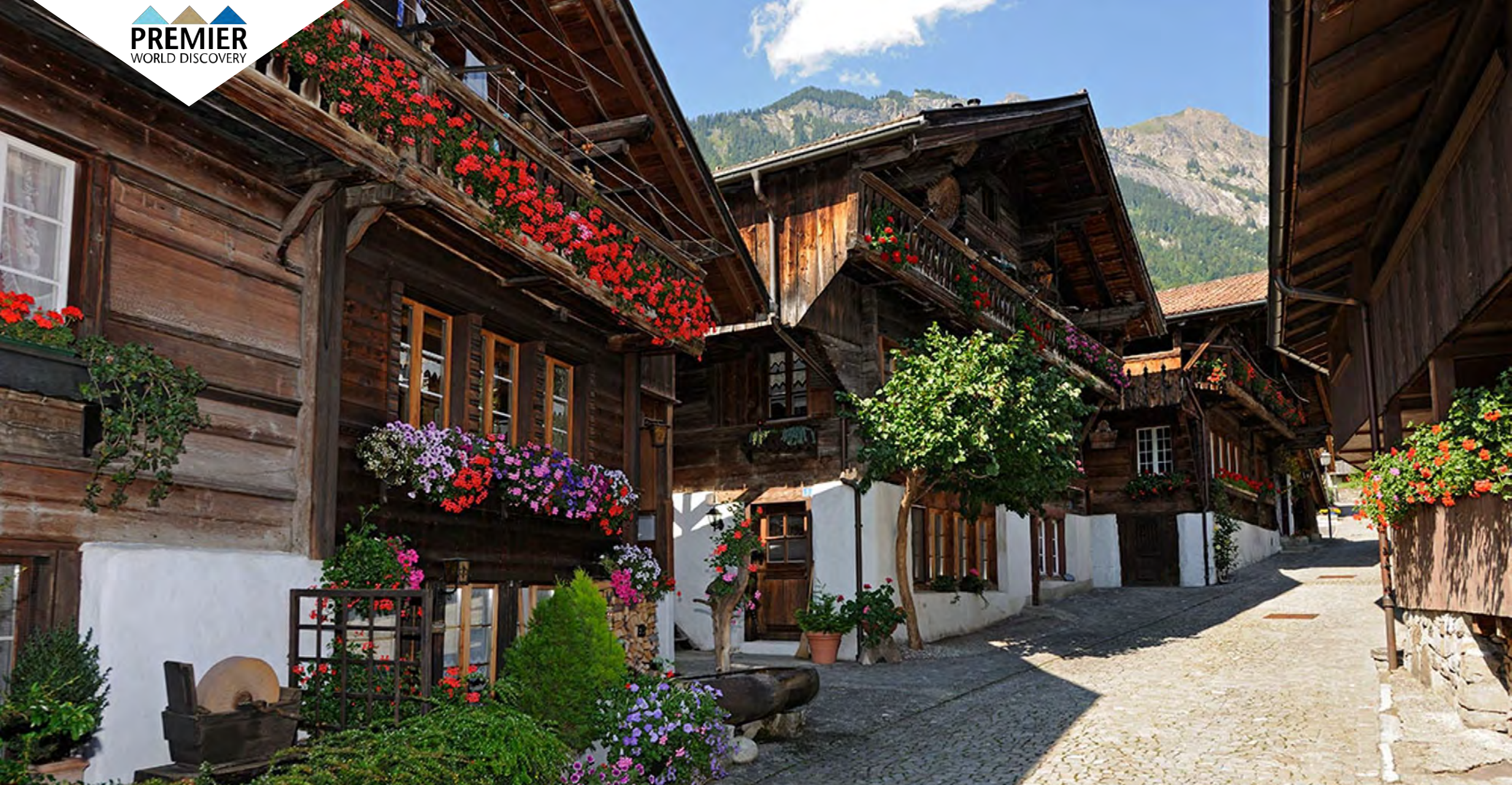
Day 8: Brienz - Brunngasse