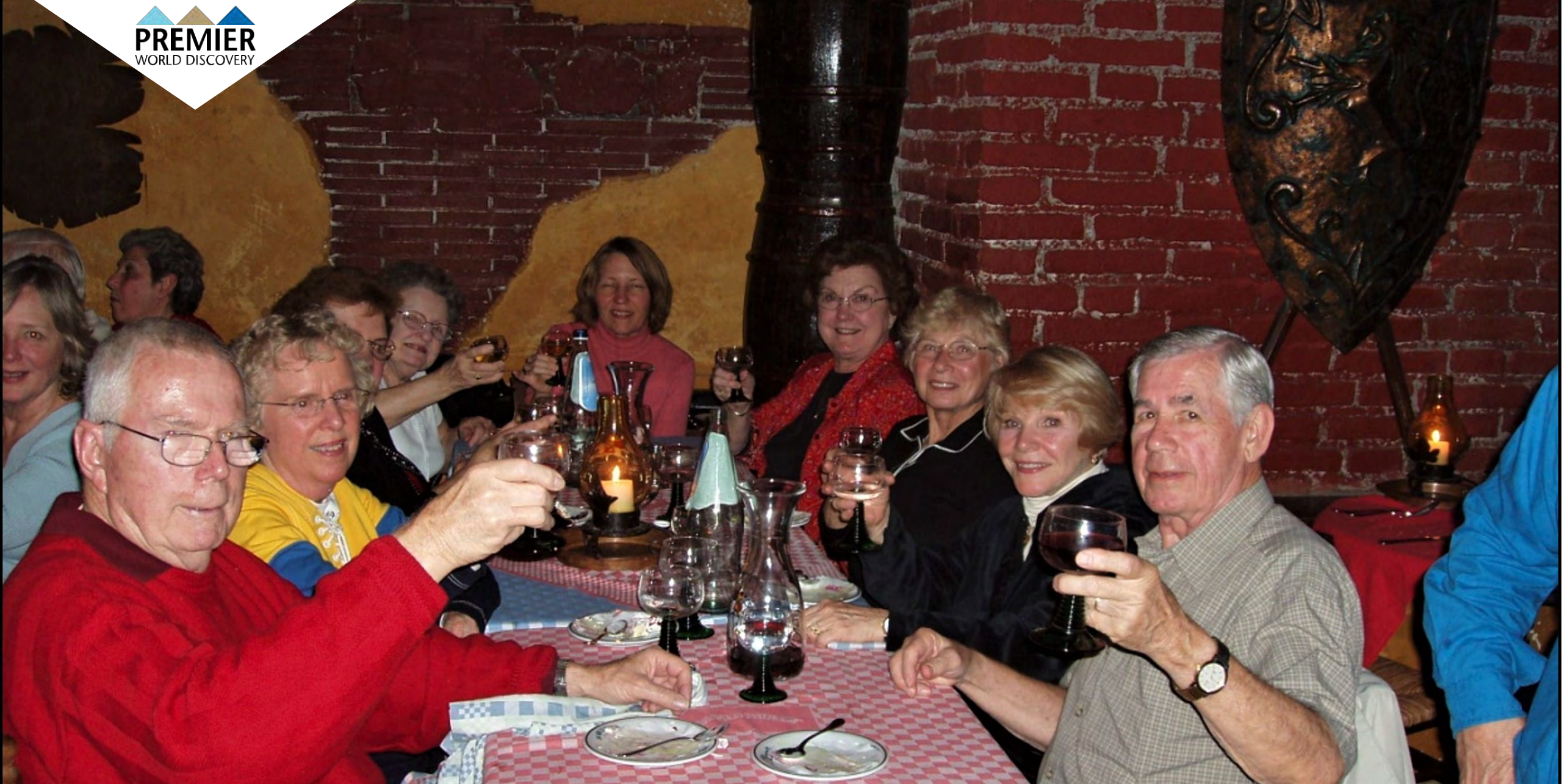
Day 8: Farewell Dinner