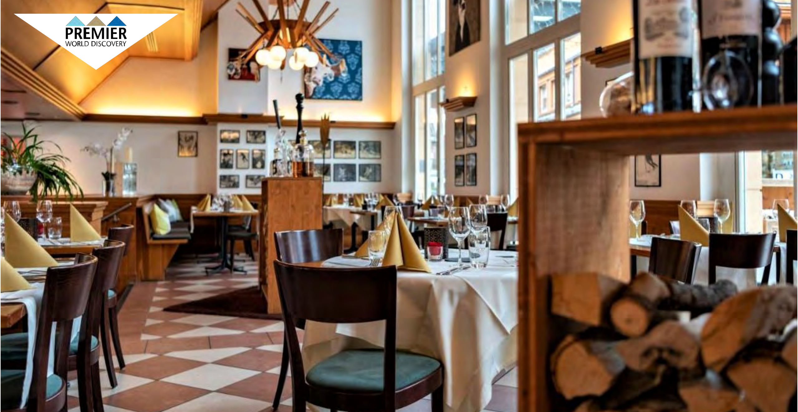
Accommodations – Arenas Resort Victoria-Lauberhorn, Wengen– 6 Nights