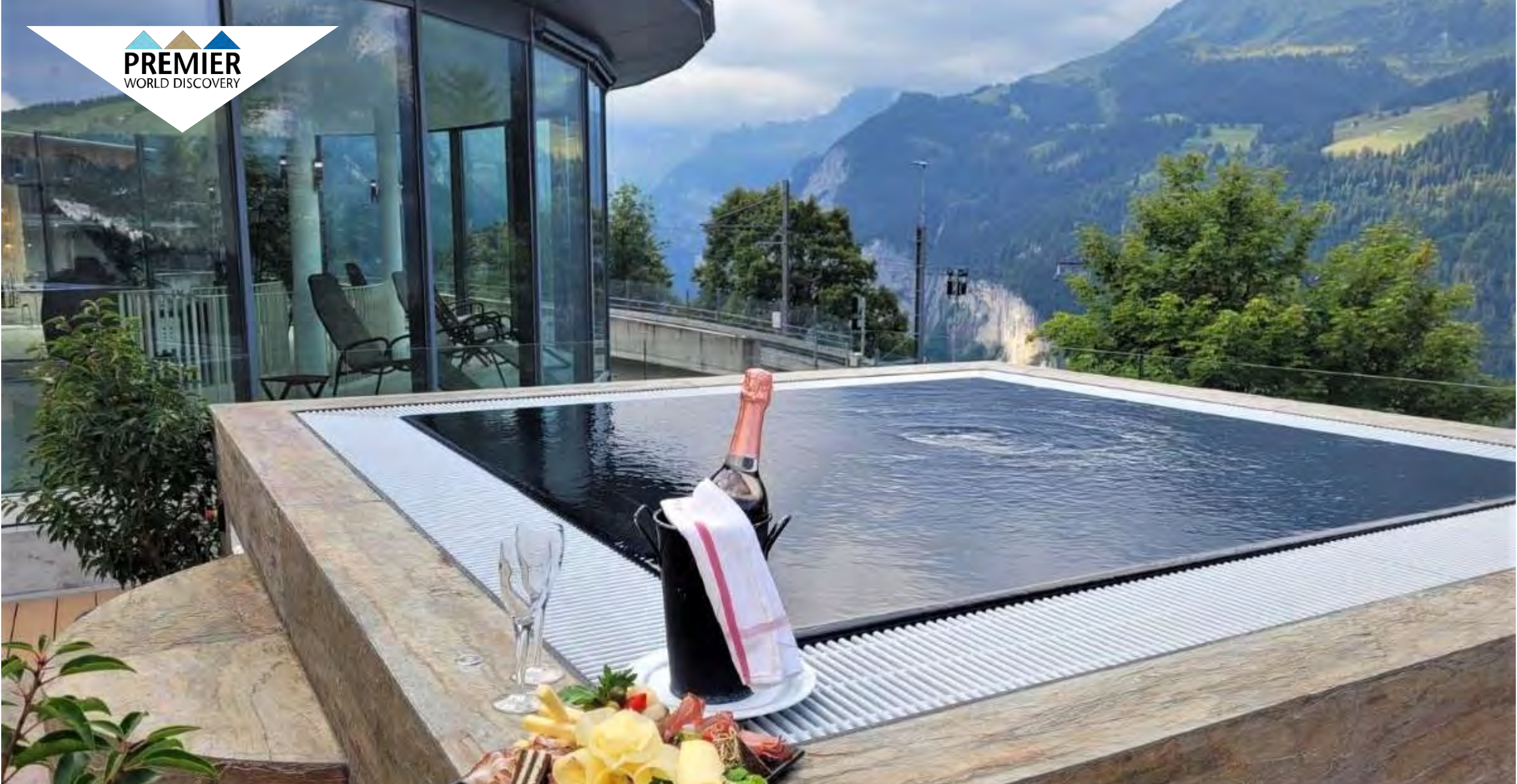
Accommodations – Arenas Resort Victoria-Lauberhorn, Wengen– 6 Nights