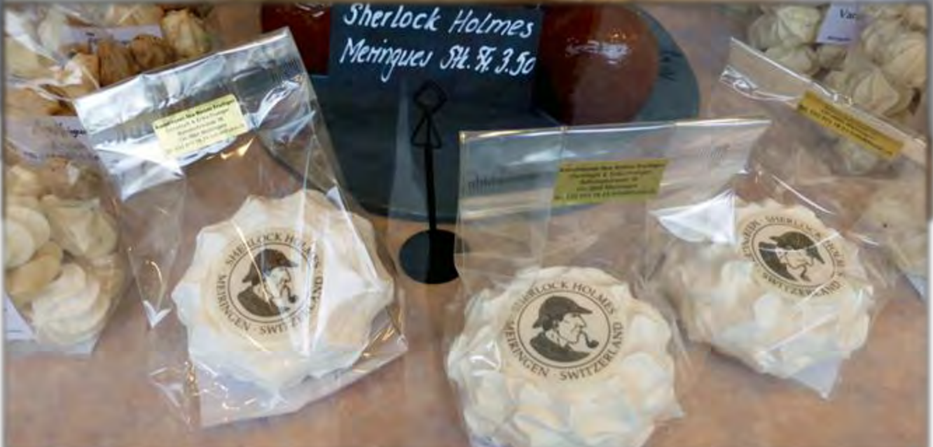
Day 7: Meiringen at Leisure – Meringues