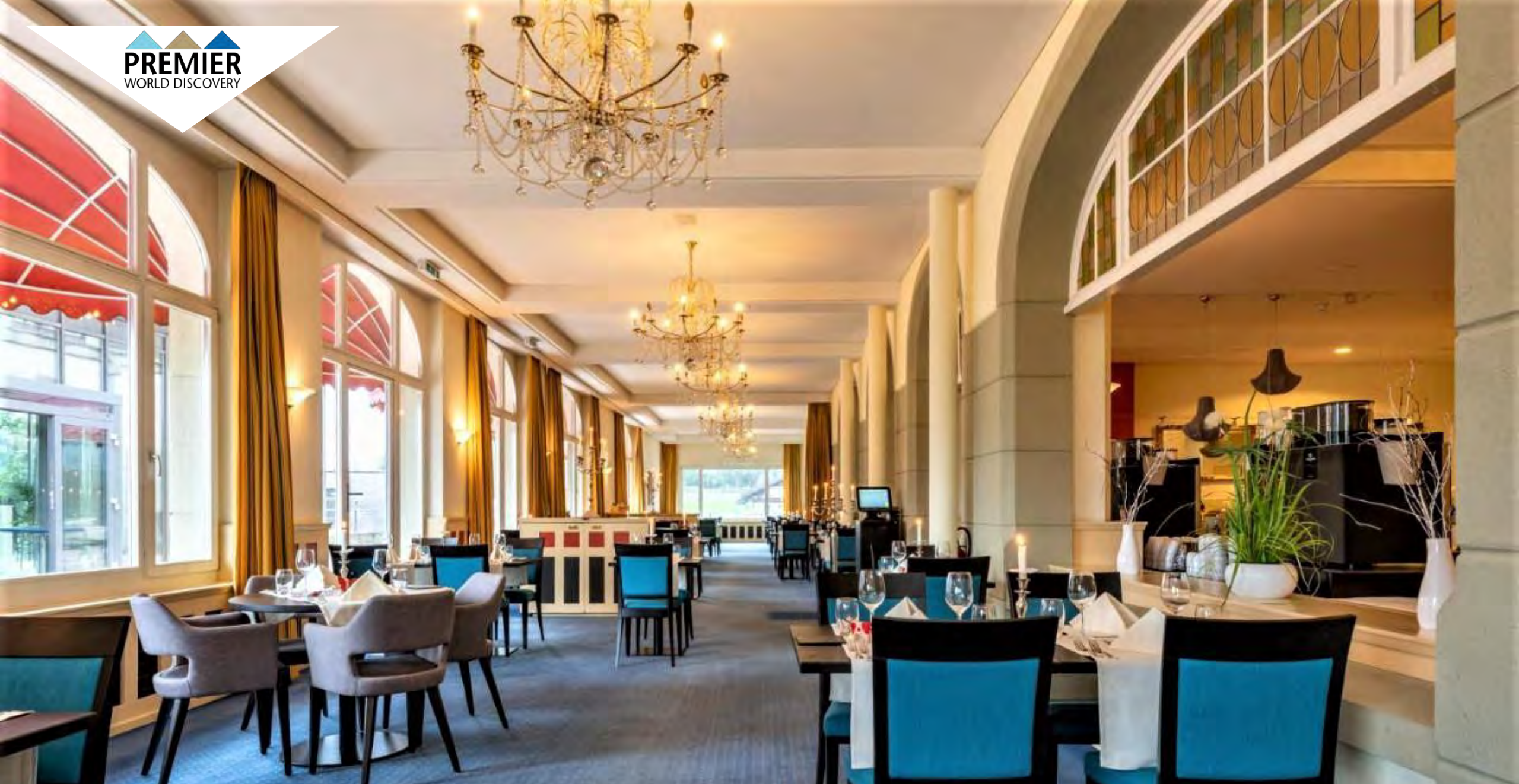
Accommodations – Arenas Resort Victoria-Lauberhorn, Wengen– 6 Nights