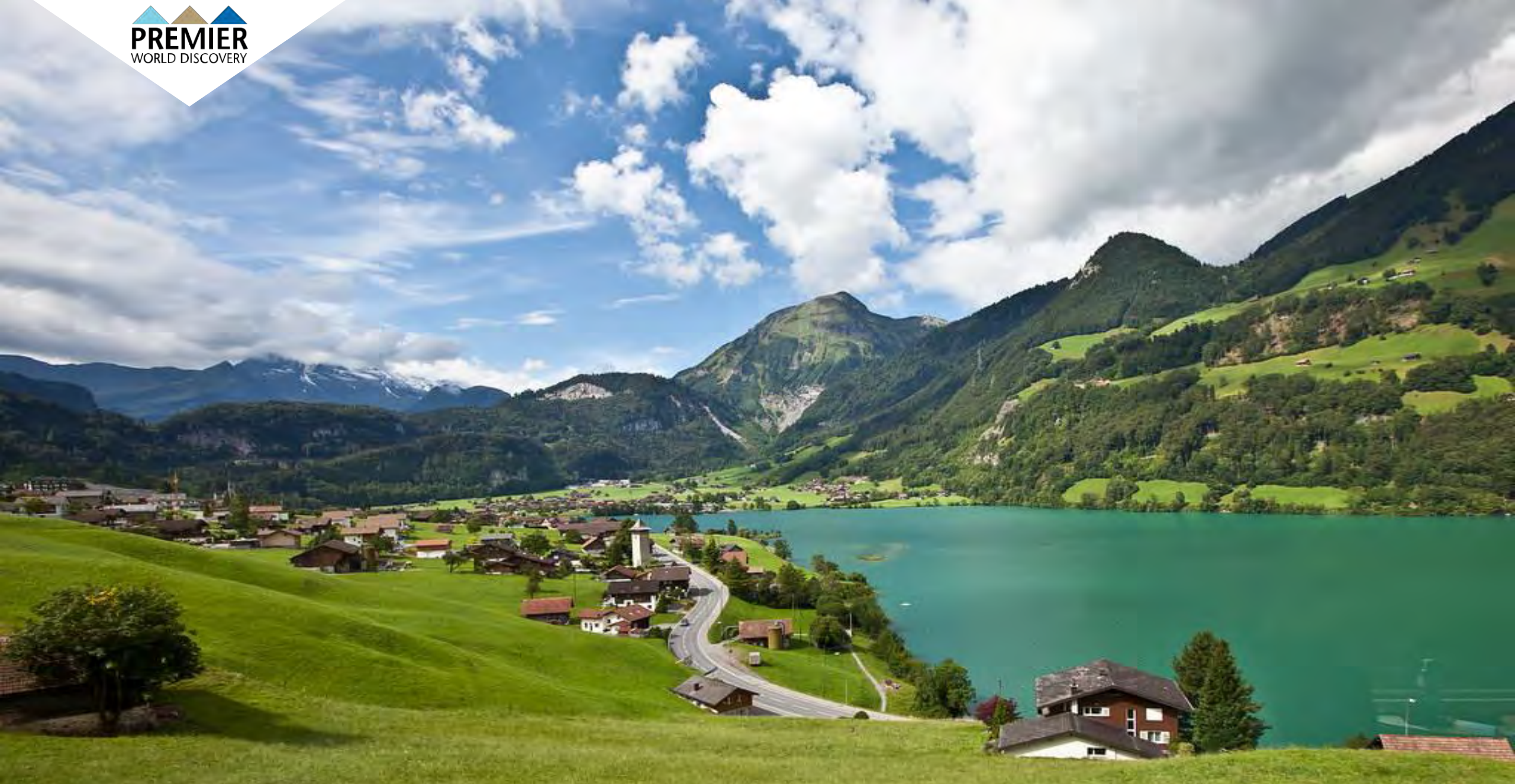
Day 8: View from Brunig Pass to Lucerne