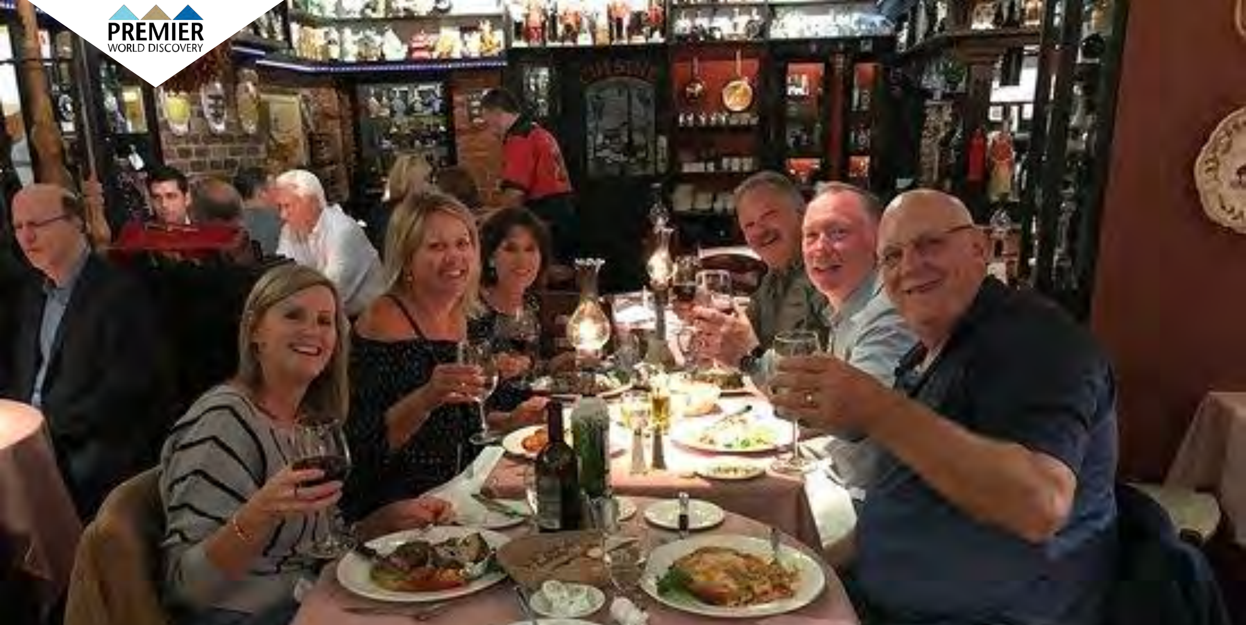
Day 2: Welcome Dinner