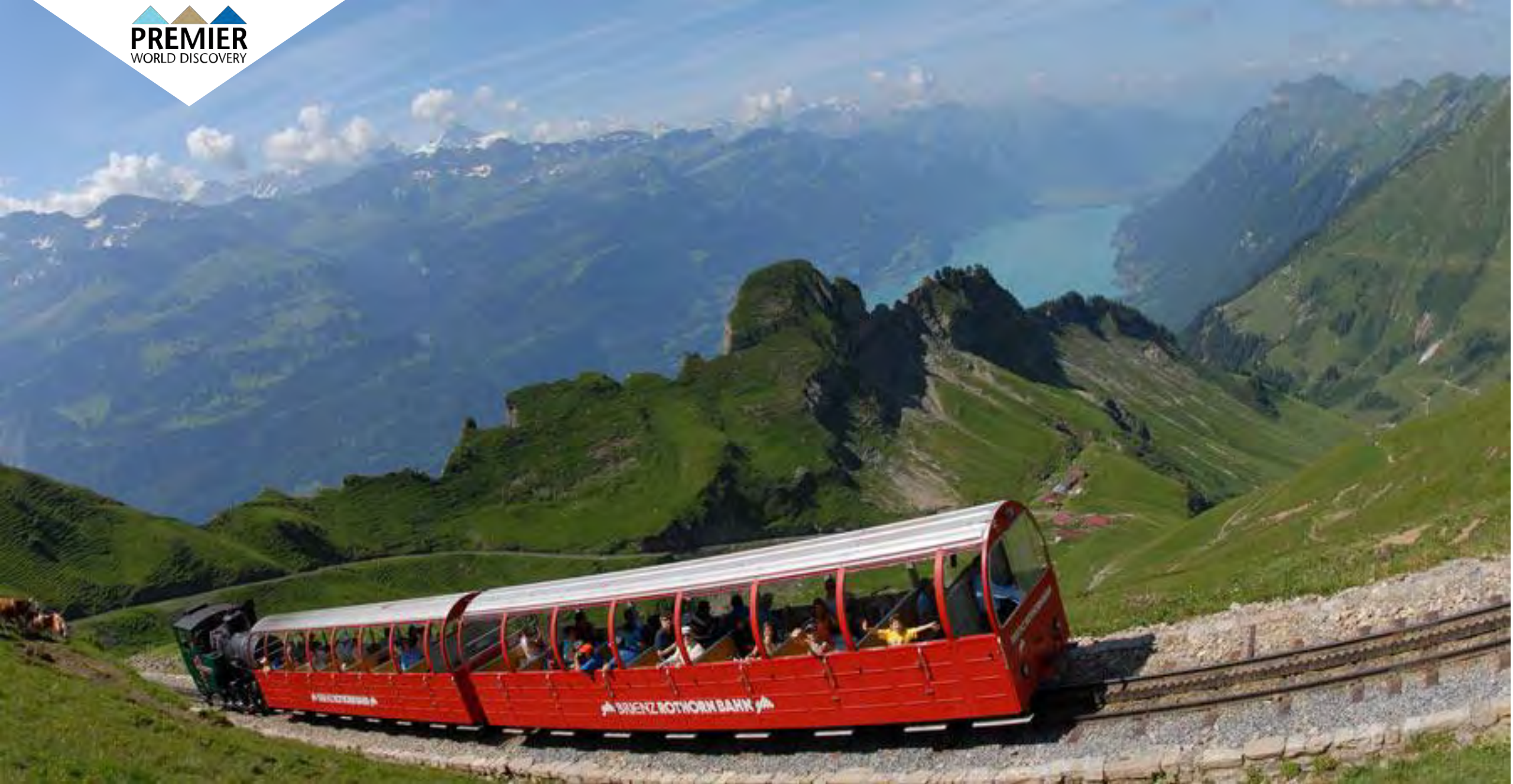
Day 5: Brienzer Rothorn Steam Train