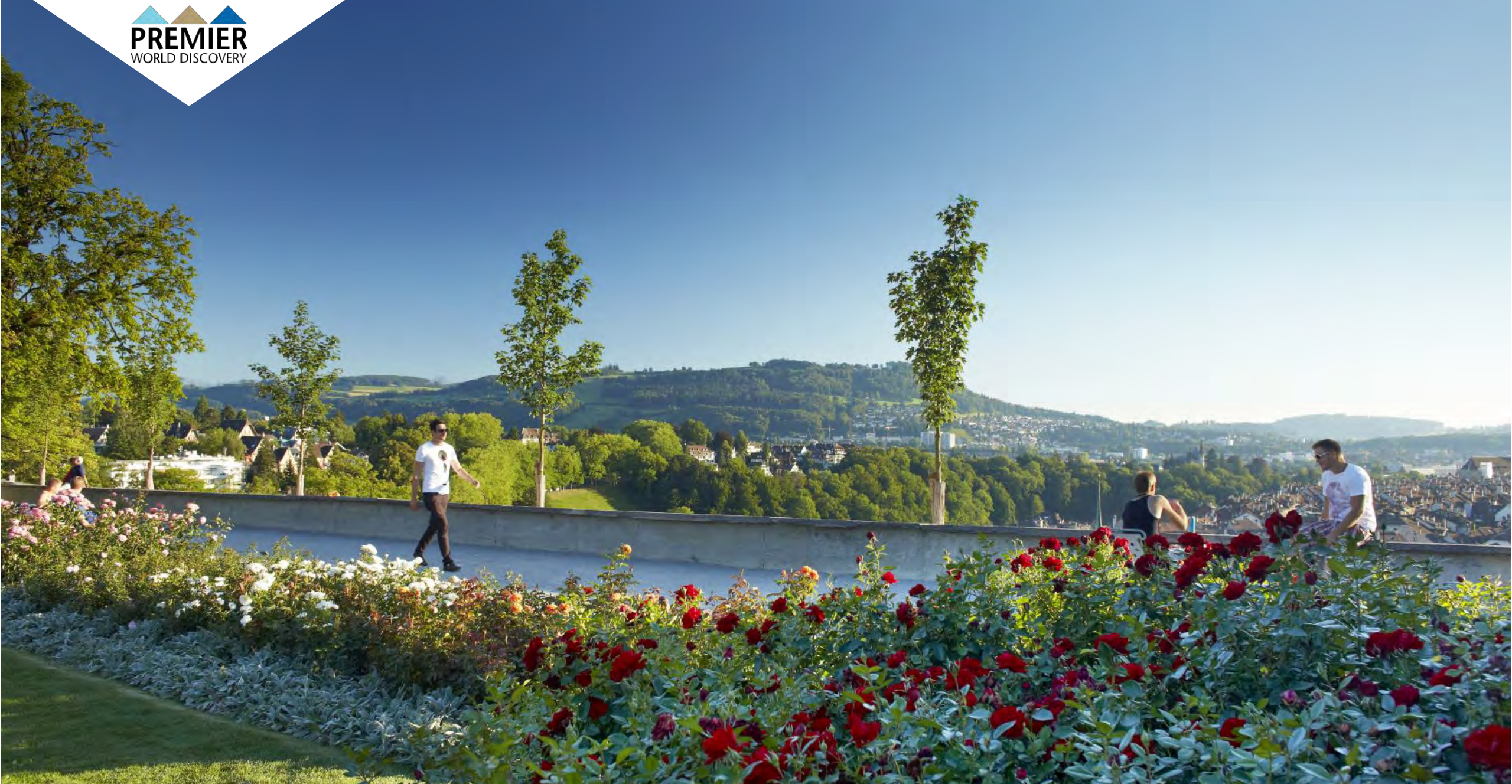
Day 2: Bern Rose Garden