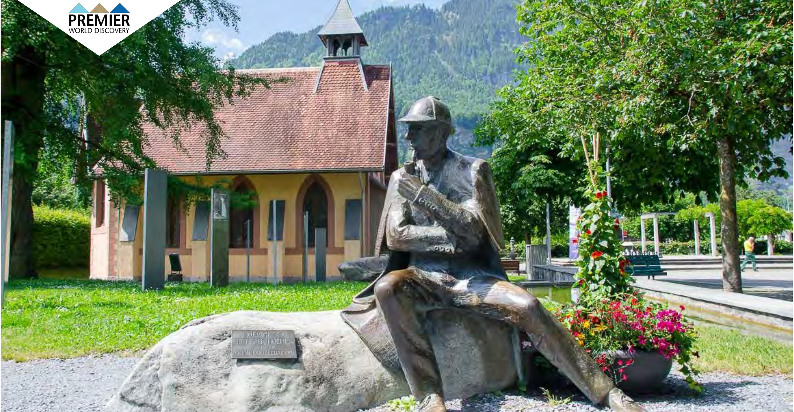
Day 7: Meiringen at Leisure – Sherlock Holmes Museum