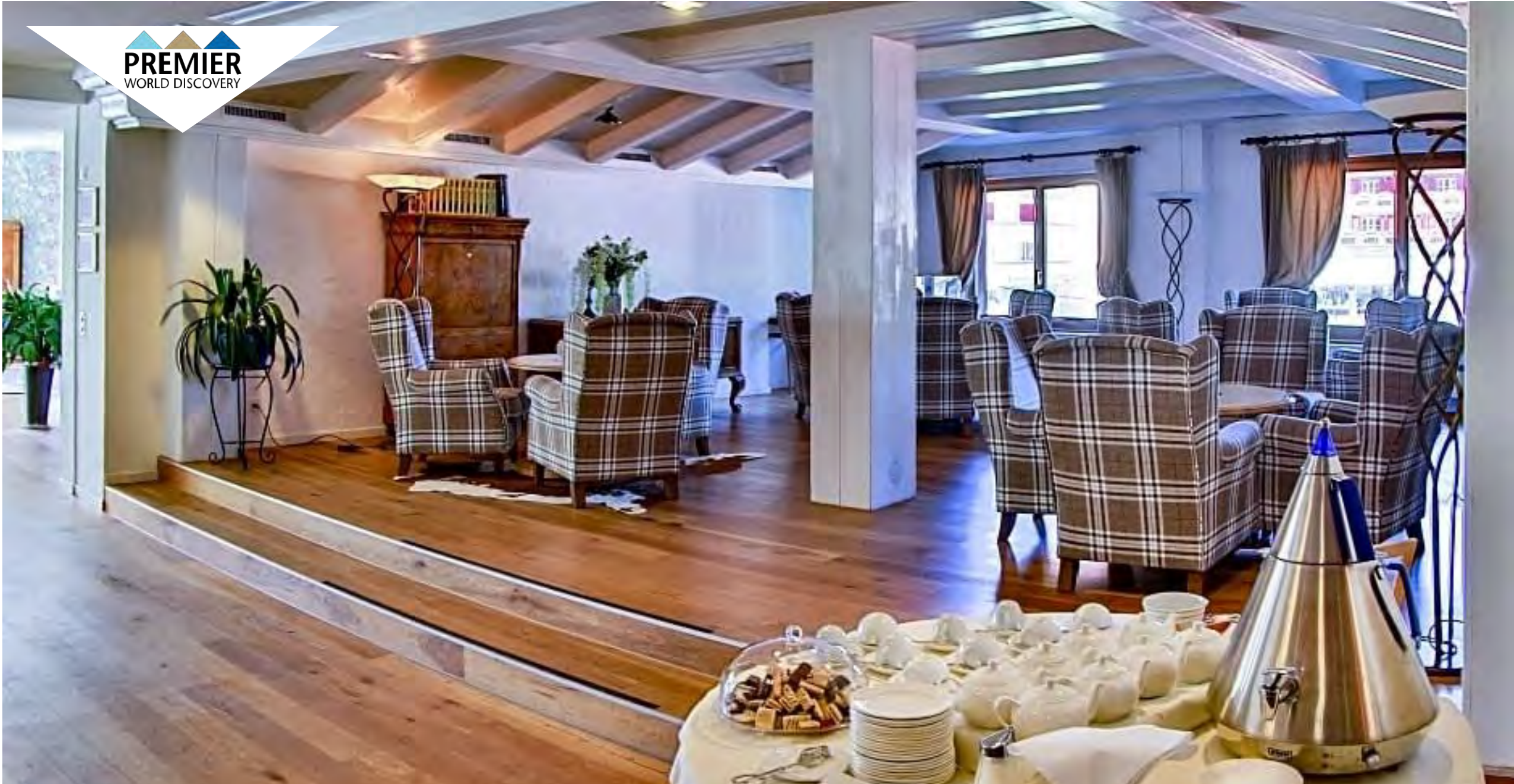
Accommodations – Silberhorn Hotel, Wengen– 6 Nights