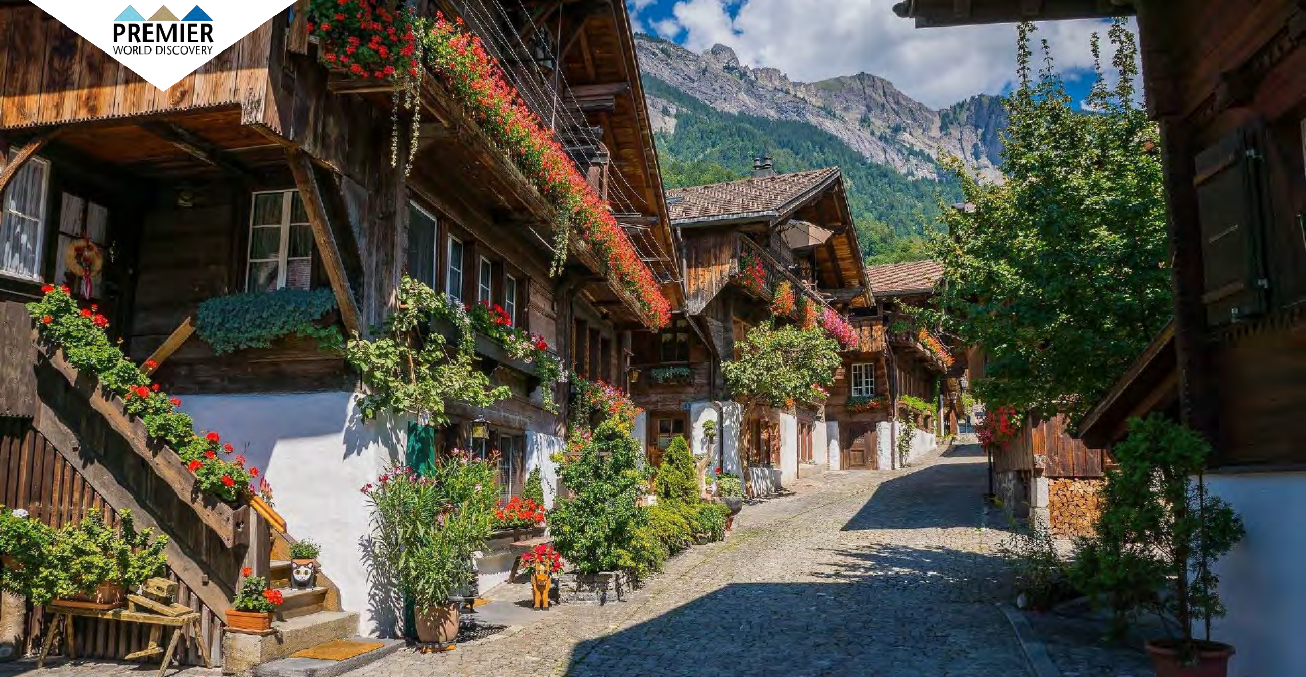
Day 8: Brienz - Brunngasse