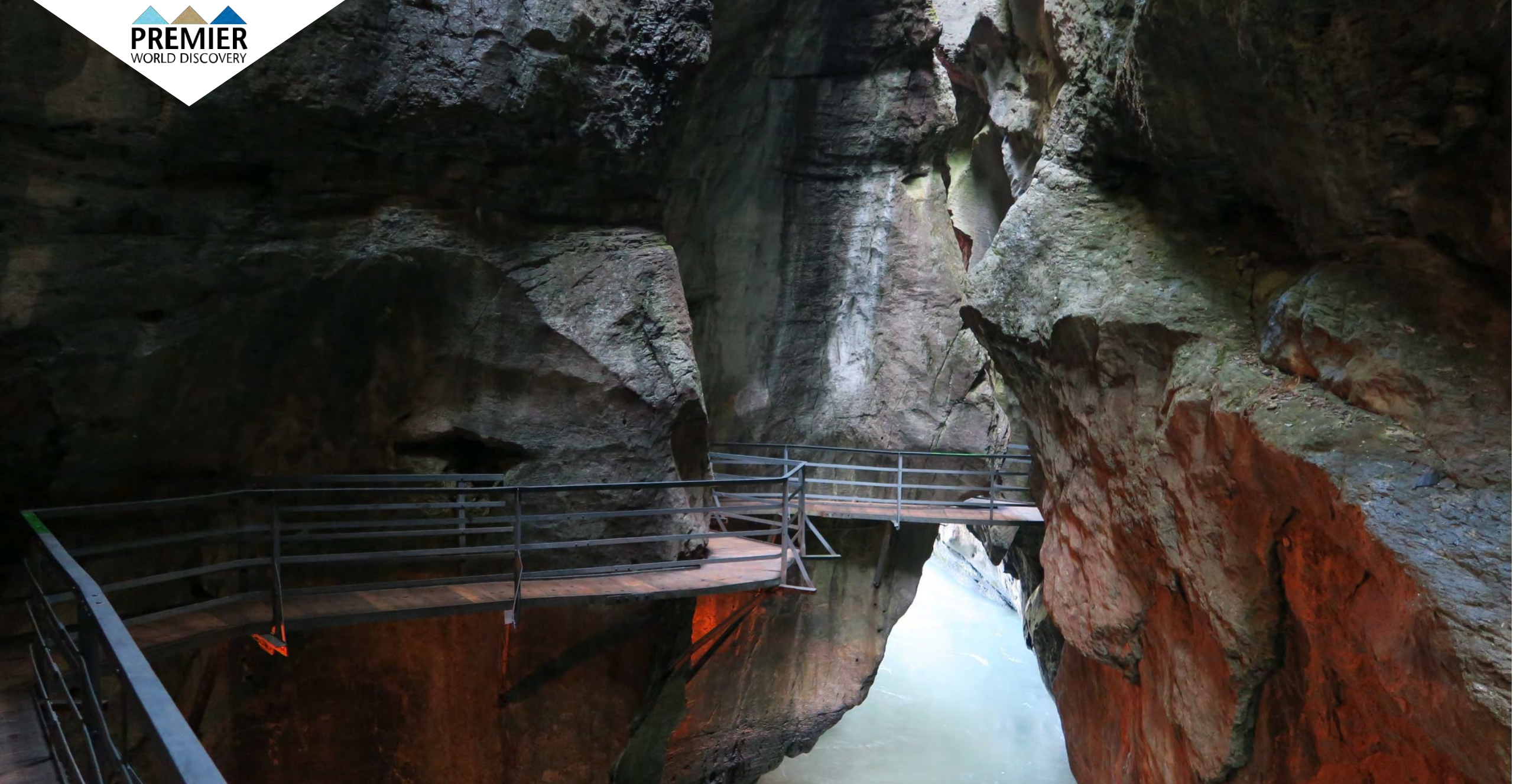
Day 7: Aare River Gorge