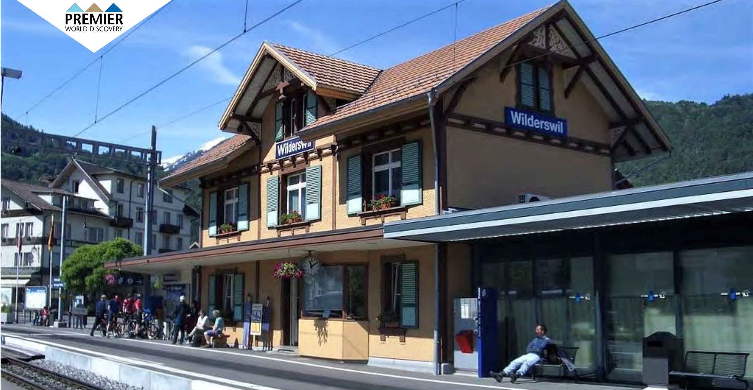
Day 5: Wilderswil Rail Station