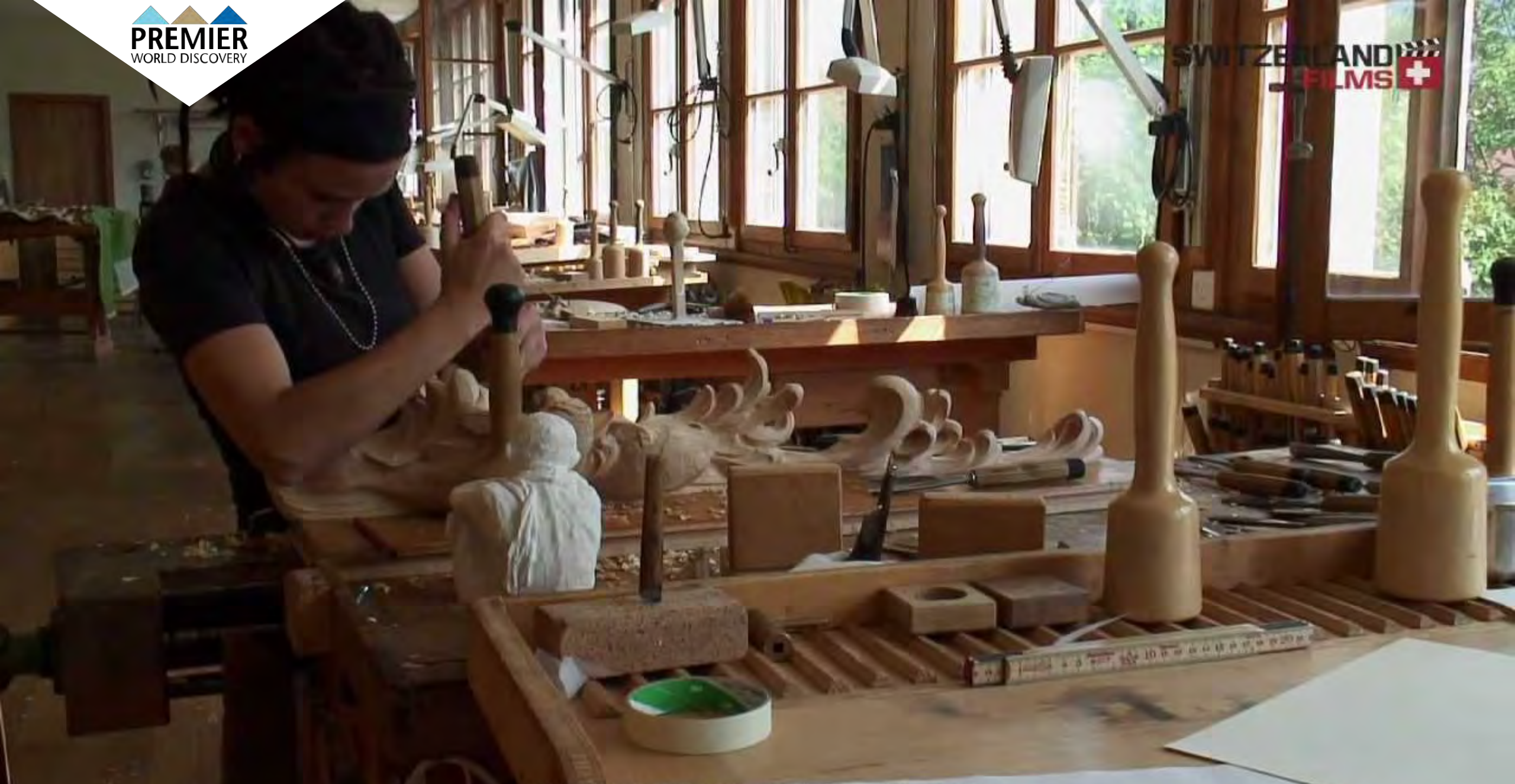
Day 8: Brienz – Wood Carving Shop